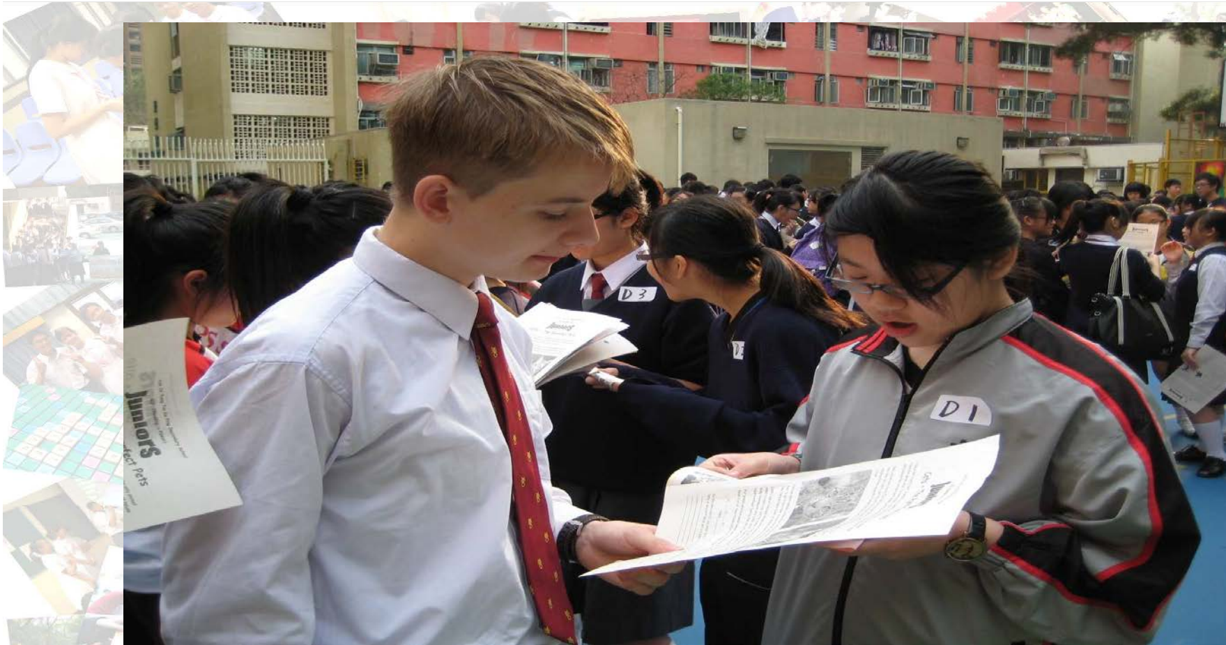
Exchange student is helping a F.1 student